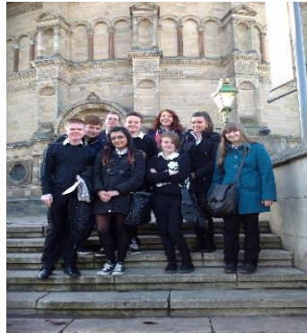
A few S3 LEAPS students

On the 4 th of December a large group of S3 students attended an orientation event at Edinburgh University. During the trip the students saw around the University campus and were asked to create a short video to explain what they had found out. The group took full advantage of the trip, completing a complete set of video blogs in less than an hour. The opportunity to explore what university life might be like has given the S3 food for thought as we plan for our Senior phase and life after school.