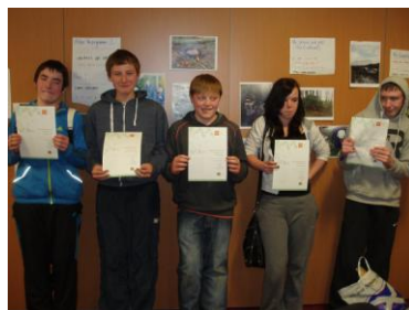
Some of the class

In December 2012, our intrepid group received their certificates from The John Muir Trust in recognition of passing their Discovery level. In order to achieve this award, the students had to partake in a variety of activities in and around Edinburgh.