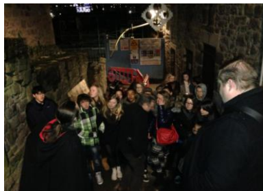
Dutch visitors on a ghost tour

March, 16 Dutch students arrived to take part with Tynecastle S3 students.