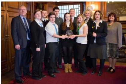
Receiving the award at the City Chambers

Nine Tynecastle students have successfully completed the two year Career Academies programme which has seen them benefit from a four week paid internship; one-to-one mentoring; workplace visits, seminars and classroom based 'Guru Lectures'.