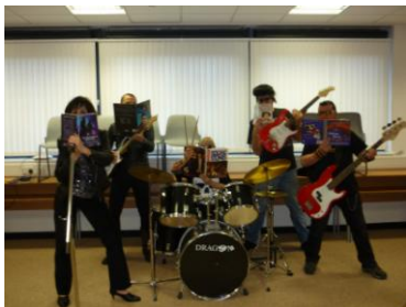
Who are you?

World Book Day is celebrated on the first Thursday in March every year and thanks to the generosity of publishers and booksellers in the UK and Ireland, £1.00 book tokens are distributed to young people under the age of 18 at this time.