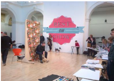
Setting up the exhibition