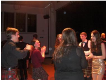
Staff, Parents & Students

On Friday 1 February our Parent Council hosted a fantastic Burns Supper, attended by a record 112 people. Students, staff, parents and friends of the school enjoyed the skirl of the pipes, a terrific meal, excellent speeches and very energetic dancing to The Roundhouse Ceilidh Band. Many thanks to those who made this such a special evening for Tynecastle.