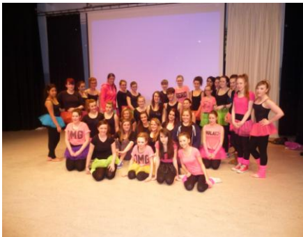
S1/2 Competition Dancers